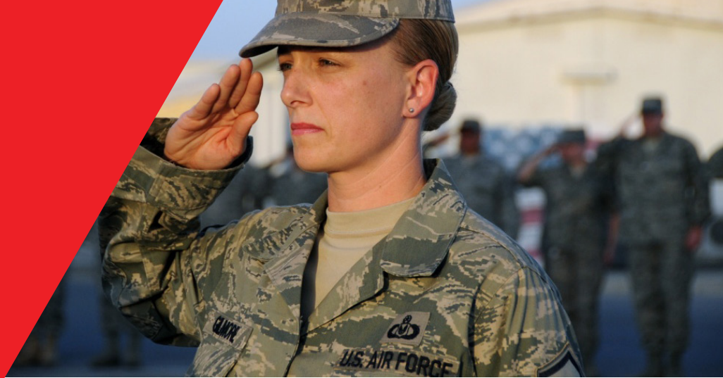
Deployed Base Honors Women's History Month With Formation, Ceremony

In order to work towards our mission for service women and women veterans, we depend entirely on the generosity of our members, community partners, and charitable foundations. In 2019, with the help of our supporters, SWAN has: