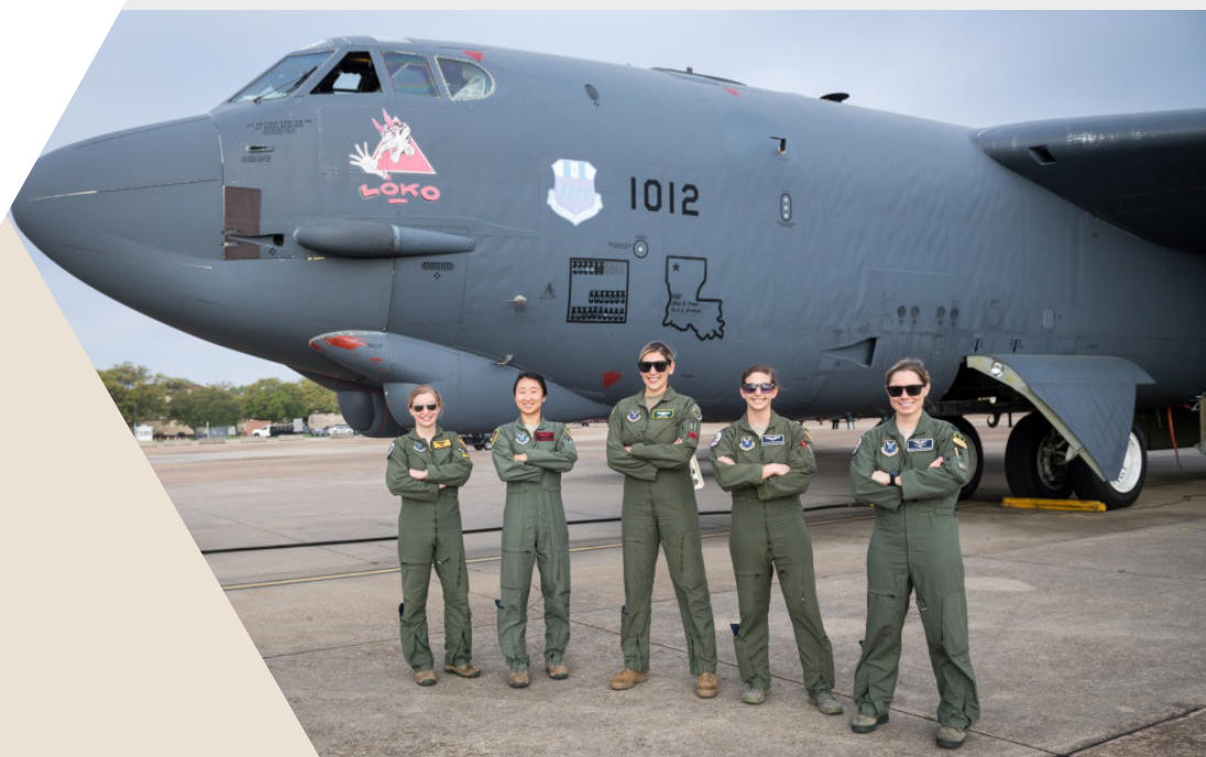
Barksdale Women Fly for Women's History Month

Develop: Maintaining organizational sustainability, transparency, and growth so that SWAN can continue its mission, increase its impact, and promote more equal and just military and veteran systems.