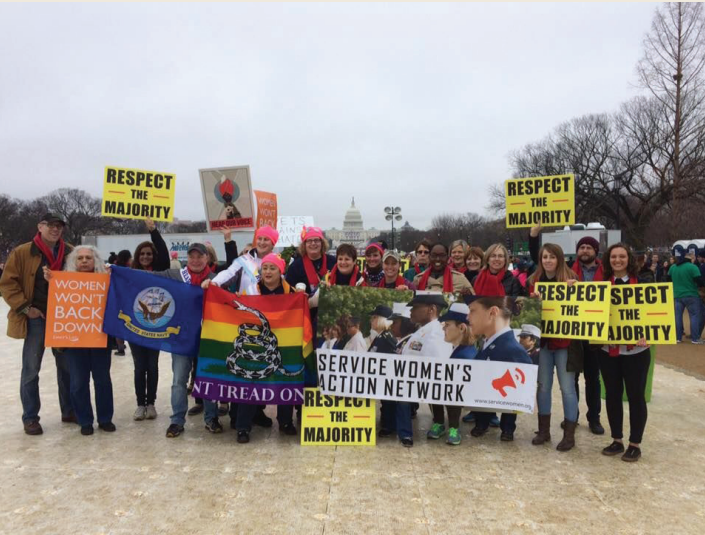
SWAN members participate in the Women's March in Washington, DC

SWAN uses its staff's expertise to educate policy makers and to advocate for legislation affecting service women and women veterans. SWAN ensures that information is easily accessible to the public so that the issues affecting service women and women veterans are understood.